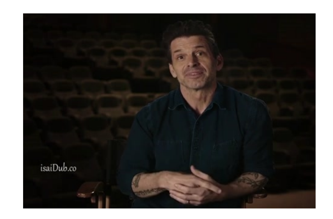
Blade Runner 2049 English Hd Mp4 Download